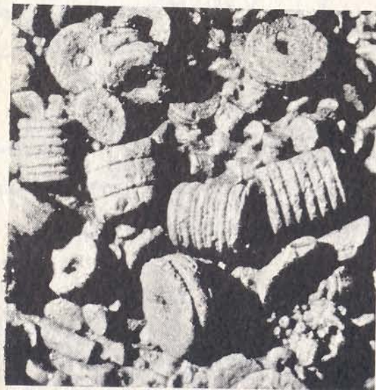
Crinoid Fossils, Crystal Caverns Cassville, Mo.