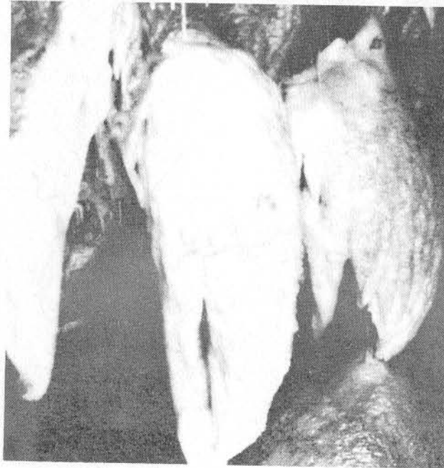
A View In "Crystal Caverns" Cassville, Mo.

Located ¼ mile north of business route 37, on well-kept road.